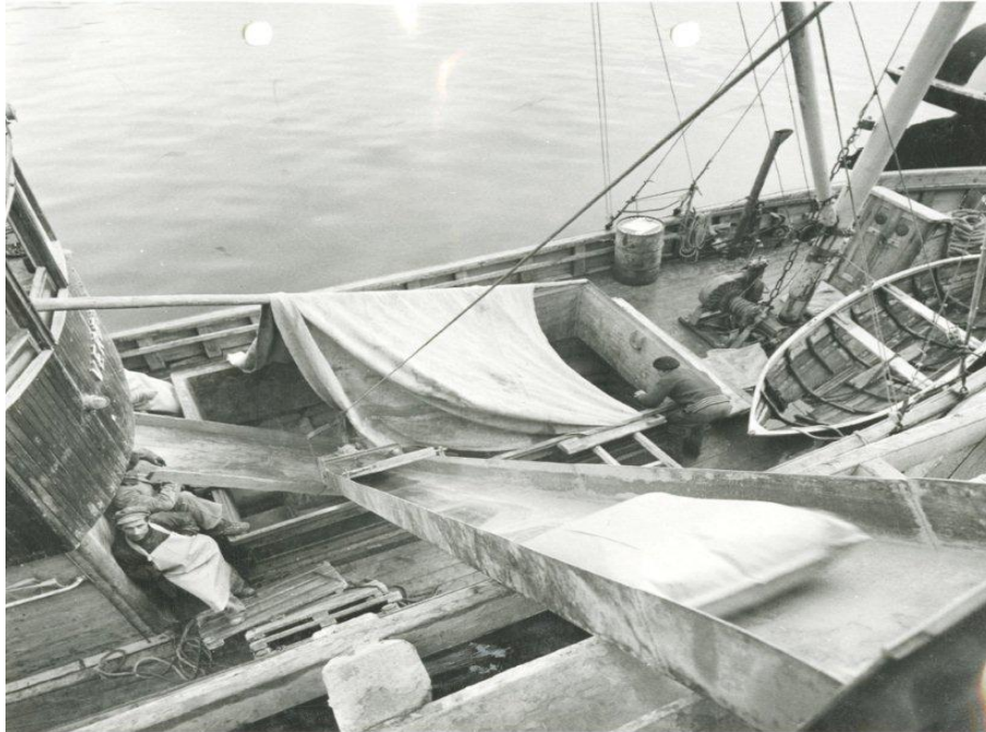
«Verbena» loading cement in the 50- 60thies in Kjøpsvik.

( Story from my book)