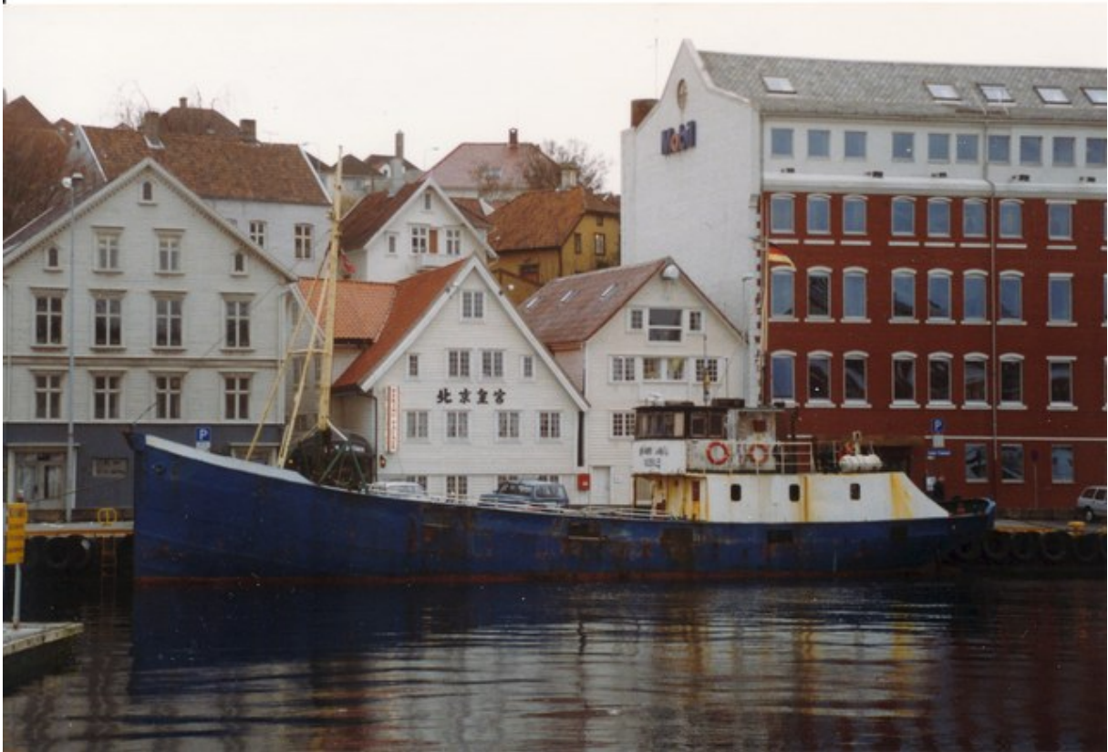
As «Noble» in Kristiansund 1993 after been sold.