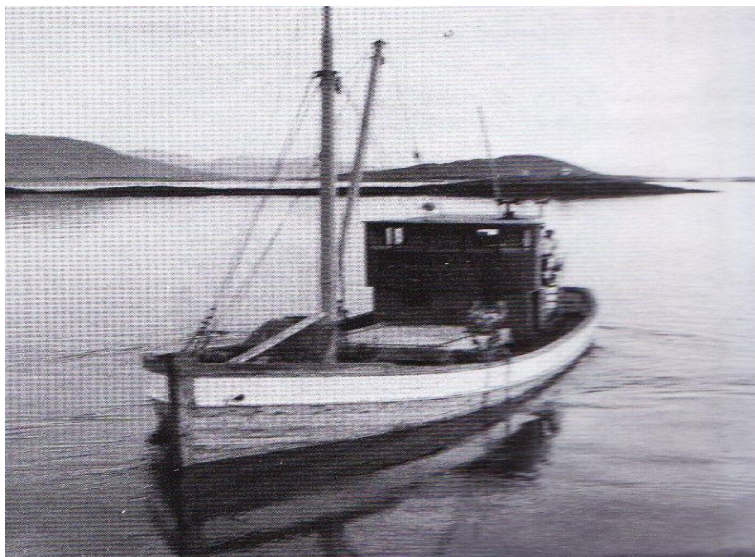
M/V «VERBENA» English cutter.