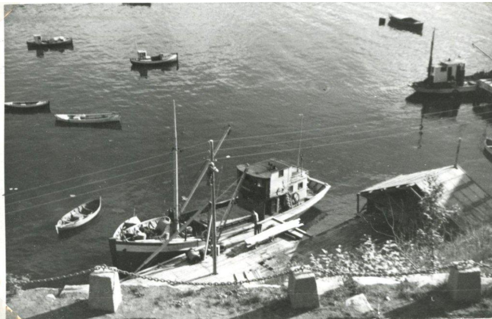
«Verbena» at Nordland Portland Cement Factory in Kjøpsvik, Nordland, Norway.

(From: www.skipet.no and translated by Google).